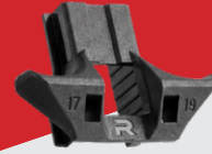
Included Charging Handle

Compatible- Glock 17, 19, 19C, 22, 23, 31, 32, 45